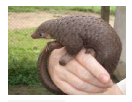
African Tree Pangolin