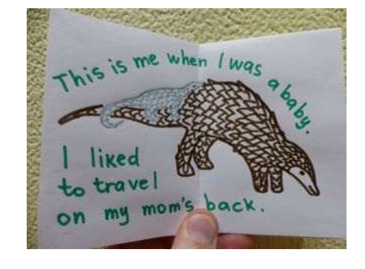
Pages 3 and 4