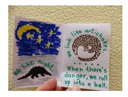
Pages 1 and 2